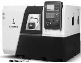
Lakshmi Machine Works Ltd www.lmwcnc.com Hall & Stall: B-107